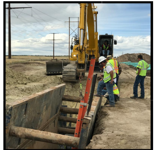
Excavation and installation of a sanitary sewer main.

Contractors for the Eagle Development Company have completed the construction of the water and sanitary sewer mains in Paint Brush Hills Filings 13B & 13C to the east of the electric power transmission lines. The next phase of infrastructure construction will begin in Filing 13D (west of the transmission lines) during the week of July 3, 2017. The utilities infrastructure construction, that includes the installation of water and sanitary sewer mains, and storm water facilities, began last month.