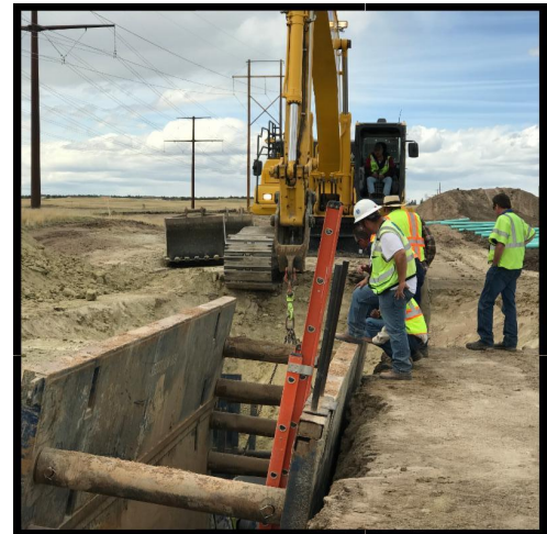
Excavation and installation of a sanitary sewer main.

benefit from additional open space that is being donated by Eagle Development. Eagle Development will also be paying for the rehabilitation of two existing wells that have been non-operational for at least ten years. They will also construct an additional well. In addition to the