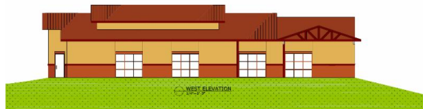
West elevation of the future District Office & Shop

The District's Board of Directors selected Copestone General Contractors of Colorado Springs to build the new District Office and Shop Building. Copestone's bid amount of $1,028,563 was the lowest among the five bids