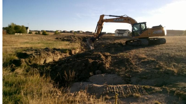
District team member, Calvin Lindt, operates excavator to clear storm water drainage channel.

The first of several storm water drainage remediation projects will start on the week of October 3, 2016. The District's Engineer has identified approximately $2 million of needed repairs and rebuilding of the District storm water facilities.